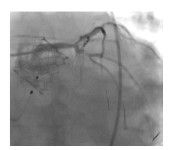
Figure 2 Even complex coronary interventions are possible after TAVR, as illustrated by the case of this 93-year-old male patient. He had undergone implantation of a SAPIEN 3 valve and then developed cardiogenic shock. Unrestricted access permitted percutaneous coronary intervention with good outcome. TAVR, transcatheter aortic valve replacement.

provided the revascularization strategy was selected by a dedicated heart team (56). Subject to the extent of coronary artery disease and anticipated future need for revascularization after TAVR, it should be considered that access to the coronary ostia can be challenging with certain types of THV in situ. However, the SAPIEN 3 and SAPIEN 3 Ultra typically permit unrestricted future reaccess to the coronary arteries ( Figure 2 ).